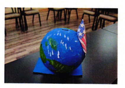
Piggy Bank Contest winners will be announced soon!