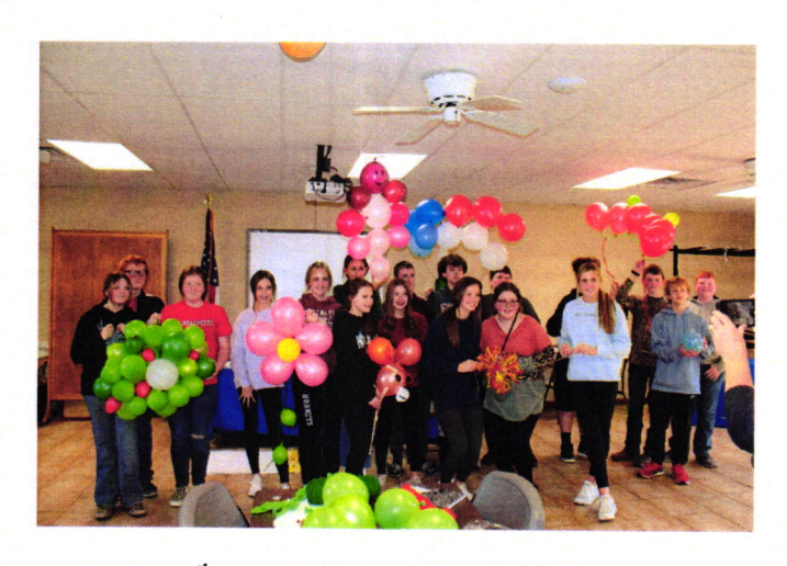
8<sup>th</sup> Grade TAG created their own Thanksgiving Parade