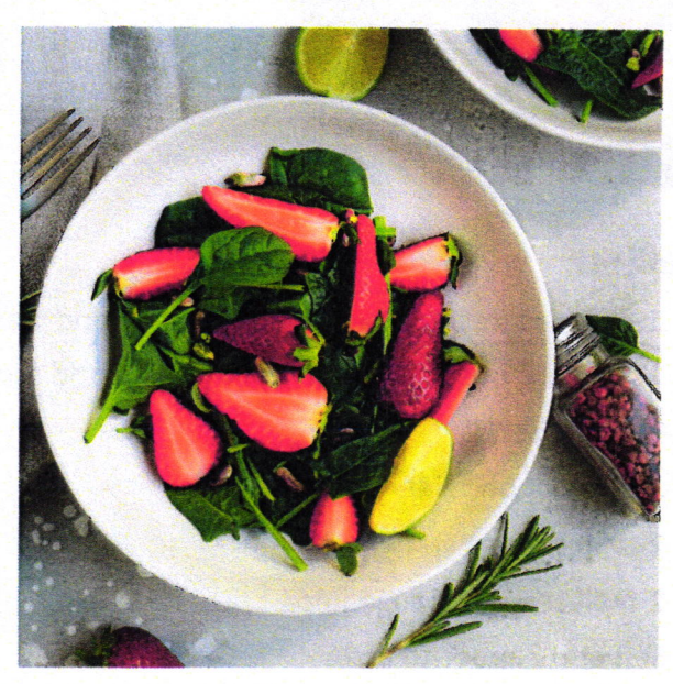
Spinach & Strawberry Salad with Jam Dressing (Recipe on page 2)

The College of Agriculture, Food and Environment is an Equal Opportunity Organization with respect to education and employment and authorization to provide research, education information and other services only to individuals and institutions that function without regard to economic or social status and will not discriminate on the bases of race, color, ethnic origin, creed, religion, political belief, sex, sexual orientation, gender identity, gender expression, pregnancy, marital status, genetic information, age, veteran status, or physical or mental disability. Inquiries regarding compliance with Title VI and Title VII of the Civil Rights Act of 1964, Title IX of the Educational Amendments, Section 504 of the Rehabilitation Act and other related matter should be directed to Equal Opportunity Office, College of Agriculture, Food and Environment, University of Kentucky, Room S-105, Agriculture Science Building, North Lexington, Kentucky 40546.