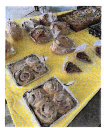
Farmers Market @ 422 East Street Fridays from 8-1 PM